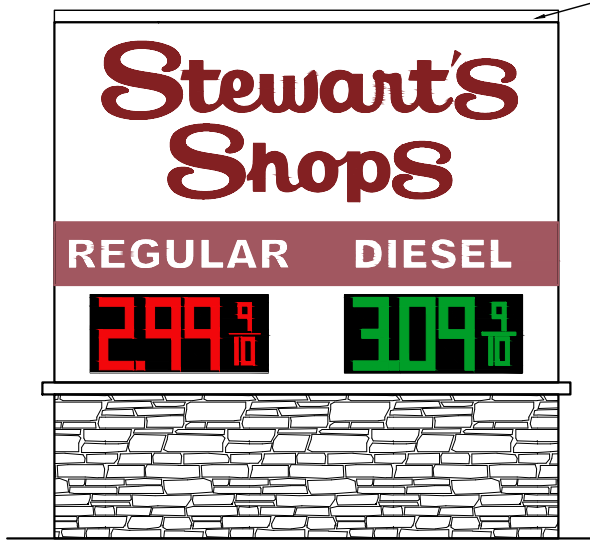
PROPOSED MONUMENT SIGN SCALE: 3/8" = 1'-0" LED DOWNLIGHTING ON BOTH SIDES AT PROJECTION AND ANGLE TO WASH DOWN SIGN FACE. SIZE: 5'-0" x 7'-0" x 35 5/8" FT. LETTERS: 1/8" FLEXIGLASS FACE ON 4-1/2" THICK CAN ILLUMINATION: EXTERNALLY ILLUMINATED WITH DOWNLITE LED LIGHTING - BURSARY LETTERS - WHITE COLOR BACKGROUND - 12" RED LED GAS PRICE NUMBERS - 12" GREEN LED DIESEL PRICE NUMBERS